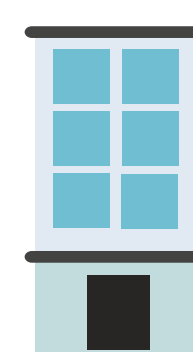
Bransholme branch site